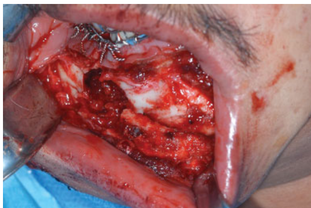
Fig. 1 Intraoperative image displaying continuity defect of mandible following trauma.

Comminuted mandibular fractures are generally the result of high-impact localized injury. Prior series have reported 5 to 10% of mandibular fractures resulting in comminution with high rates of malunion or nonunion. 48,49 Historically, open reduction was not pursued in these fracture types as the risk of vascular compromise of the osseous fragments and resultant sequestration was believed to preclude such intervention. 48 More recently, open reduction and internal fixation techniques have been implemented in these injury patterns (→Figs. 1–3). Rigid fixation of osseous fragments decreases sequestration while promoting an earlier return to function. 48-53 The entire comminuted fracture complex is exposed and plated using load-bearing osteosynthesis. Nonviable fragments are debrided and the resulting defects are bone grafted. Stabilization with use of load-sharing plates is contraindicated due to the inability for compression of small