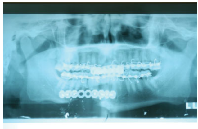
Fig. 3 Radiograph showing maxillomandibular fixation with the placement of reconstructive plate along inferior mandibular border.

fragments. 48-50 Rigid fixation of projected pre-morbid occlusion is initially performed with the use of arch bars, wiring, or acrylic splints. An extraoral approach toward fracture exposure is then performed while maintaining the lingual periosteum when possible to stabilize osseous segments and prevent devascularization. Fracture “simplification” is then performed by fastening smaller fragments into larger segments with the use of miniplates or lag screws. This simplified construct is then further stabilized with the use of a locking reconstruction plate with three or more screws on either side of the fracture ends. MMF may then be removed following internal fixation to mitigate ankylosis. 44,48-50