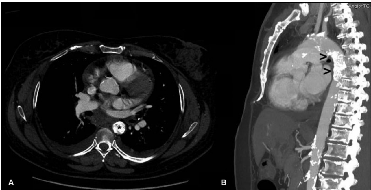
Fig. 1 Computed tomography showing occlusion of the descending thoracic aorta (axial view in panel A and sagittal view in Panel B) by a massive calcific plug (asterisk in Panel A and arrowheads in Panel B). Diffuse calcification of the entire aorta is also present.

The patient was referred to our hospital for pulmonary edema due to a hypertensive crisis. Her past history included a subarachnoid hemorrhage successfully treated by clipping of a saccular aneurysm of the right internal carotid artery. The electrocardiogram showed signs of left ventricular