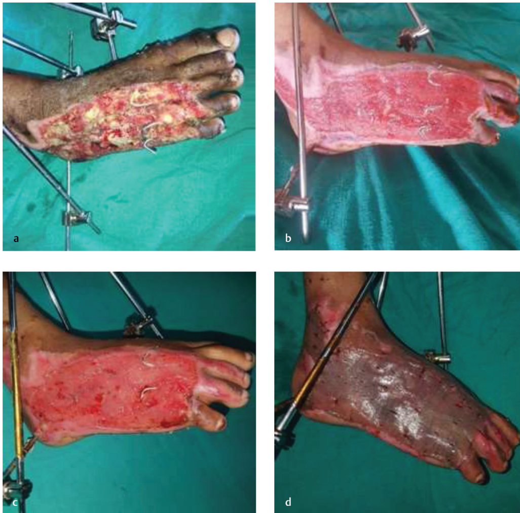
Fig. 3 (a) Post-traumatic wound with exposed bones/tendons over the lateral aspect of foot. (b) Post-traumatic wound with exposed bones/tendons over the lateral aspect of foot. (c) Wound fully covered with granulation tissue after 17 days of vacuum-assisted closure therapy. (d) Wound covered successfully with split-thickness skin graft.

The mean duration of completion of successful VAC therapy in our study was 12 days. Eltayeb et al 14 also observed a mean duration of successful VAC as 12 days in their patients, but some authors have reported relatively higher average number of days needed to grow healthy granulations. 10,17 Baharestani et al, however, could manage the complex soft tissue wounds in children by VAC therapy with a mean duration of 10 days. 18 This variation in mean duration of therapy required is again probably explained by different clinicopathological factors involved in wound healing.