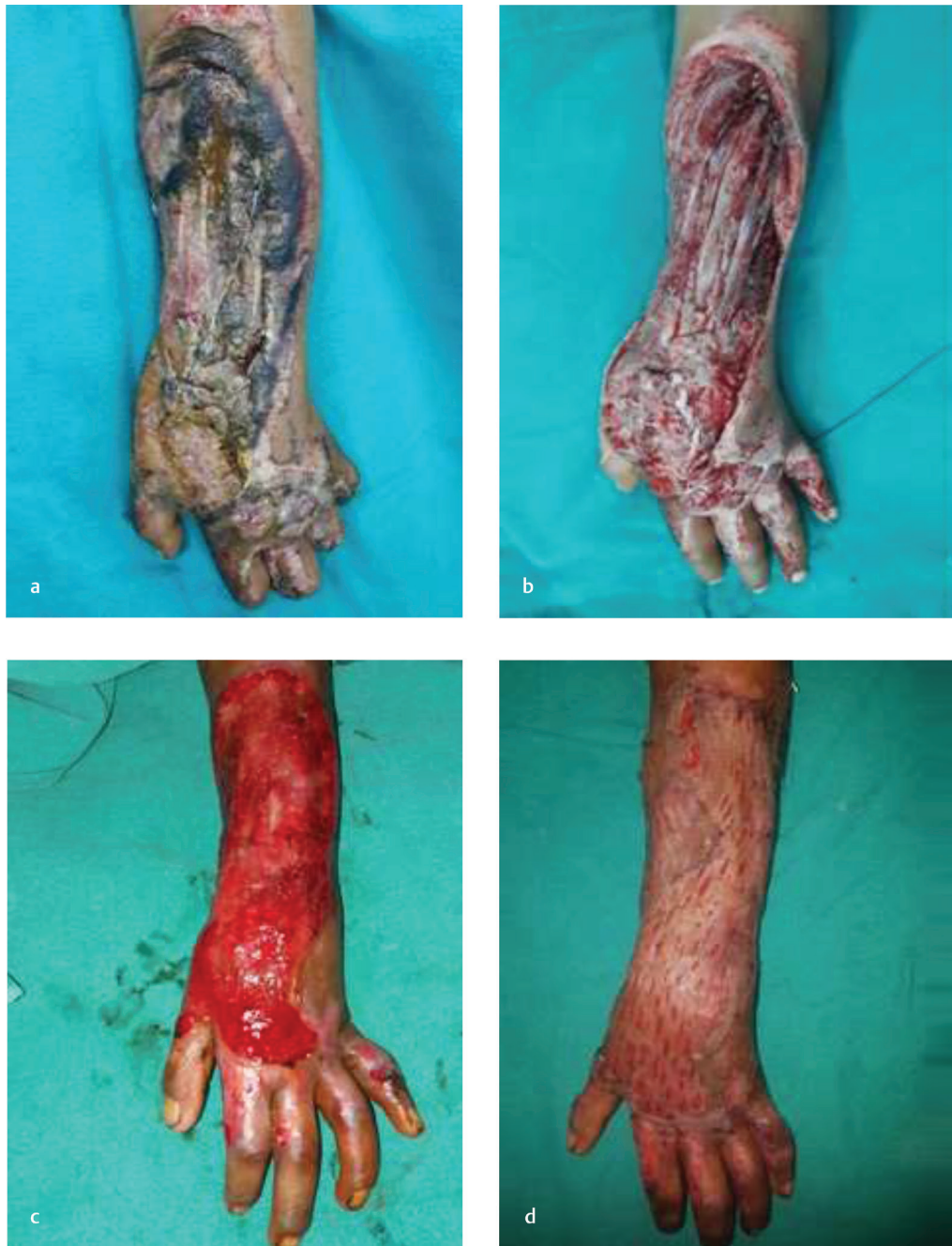
Fig. 5 Patient with post-traumatic compound defect over forearm. (b) Wound after debridement showing exposed bone/tendon. (c) Wound after 22 days of VAC therapy. (d) Wound managed definitively by split-thickness skin graft.

complex soft tissue defects in children without the morbidity and complications associated with flap procedures.