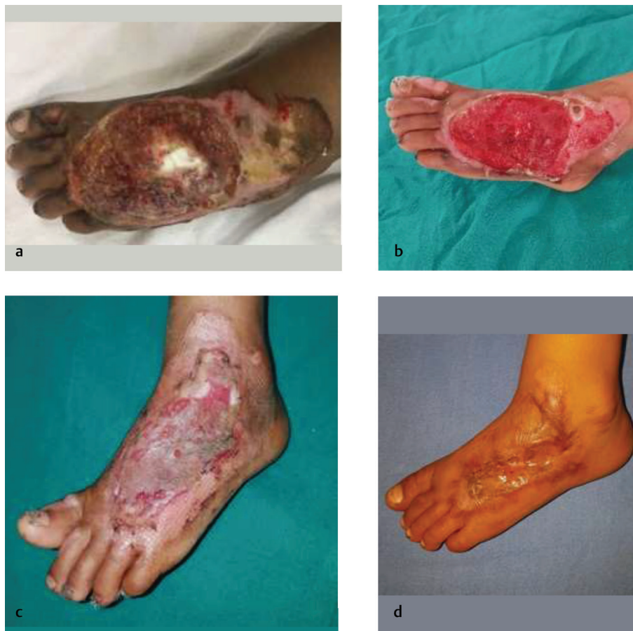
Fig. 2 (a) Patient with exposed bone over anterior aspect of foot. (b) Exposed bone covered by healthy granulation tissue after 18 days of vacuum-assisted closure therapy. (c) Wound after 2 weeks post split-thickness skin graft. (d) Well-settled graft after 6 months.

8 cm 2 (range 4–34 cm 2 ). Exposed tendon (► Fig. 3 ) was present in 15 cases with mean exposed tendon length of 4 cm (range 1–7 cm). The average number of VAC dressings applied was 4.5 (range 2–9). The mean duration of VAC therapy in our study was 12 days with a range of 6 to 27 days. In our study patients, more than 90% coverage of the exposed structure was seen in 89% of subjects and in four patients only <50% coverage of the exposed structure was seen. Eighty-nine percent of patients were managed by STSG, 6.5% patients required flap coverage and 4.3% patients required both STSG and flap coverage for the management of their wounds. No significant complications were seen in the patients. Minor episodes of pain, periwound maceration, and bleeding were seen during the treatment.