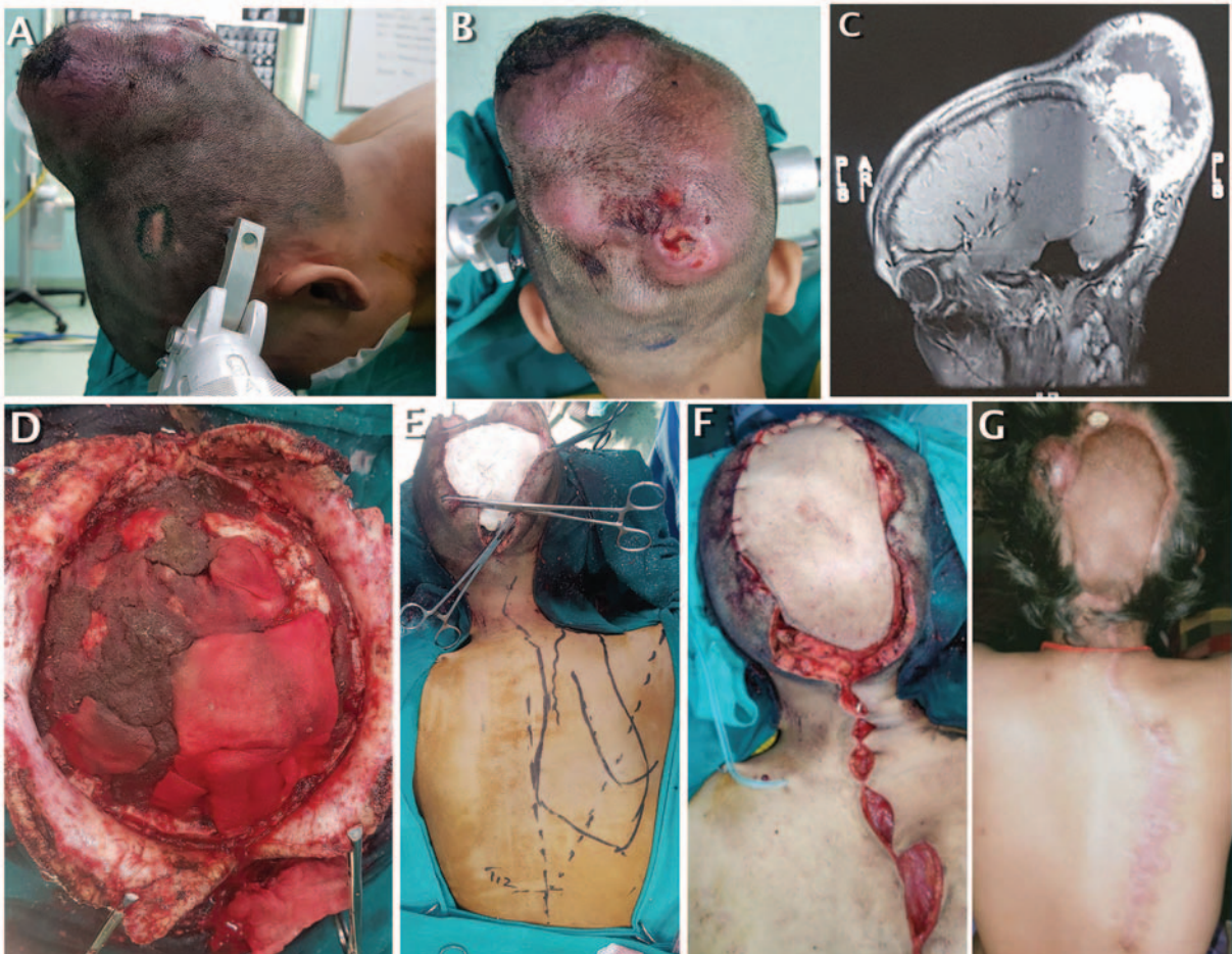
Fig. 3 Image showing (A,B) fungating calvarial tumor, (C) MRI scan showing intracranial extension, (D) duraplasty covered with adrenaline soaked gauze, (E) the calvarium reconstructed with PMMA implant and in situ marking for the right trapezius myocutaneous flap, (F) flap inset, and (G) well-settled flap with minor wound dehiscence. PMMA, polymethyl methacrylate.

instrumentation. Paraspinal muscles were sloughed off and unavailable for reuse. Though a free flap would be an ideal choice, it was kept as a last resort. In ► Fig. 5C , the skin markings show the outline of the trapezius muscle, and the dotted line on the right side show the markings of the bipediced flap. The trapezius muscle was included in the bipediced flap till T12, and beyond this, the flap was undermined completely. We noticed that the flap could be advanced 8 cm medially at the center point (► Fig. 5D ). On the left side, a trapezius myocutaneous flap was designed in a V-Y fashion, and the muscle was dissected free on the lower, medial, and lateral sides, retaining its blood supply from the upper aspect. The secondary defect that was created by bipediced flap was covered with a latissimus dorsi myocutaneous V-Y advancement flap. The donor-site defect in the inferior aspect was covered with a skin graft (► Fig. 5G ). Patient's wounds healed completely (► Fig. 5H ).