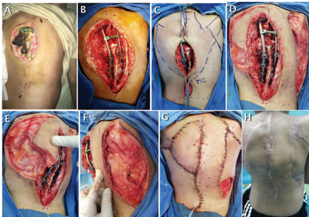
Fig. 5 Image showing (A) ulcer over the back with slough exposed thoracic spinal implant, (B) spinal implant and thoraco-lumbar spine, (C) markings of the trapezius flap on both sides, (D) left trapezius myocutaneous V-Y advancement flap and right bipedicle trapezius myocutaneous flap, (E) advancement of left trapezius myocutaneous V-Y flap, (F) advancement of the right bipedicle trapezius myocutaneous flap, (G) final wound closure after closing the secondary defect with V-Y latissimus dorsi flap on the right side, and (H) well-settled flaps and skin graft.