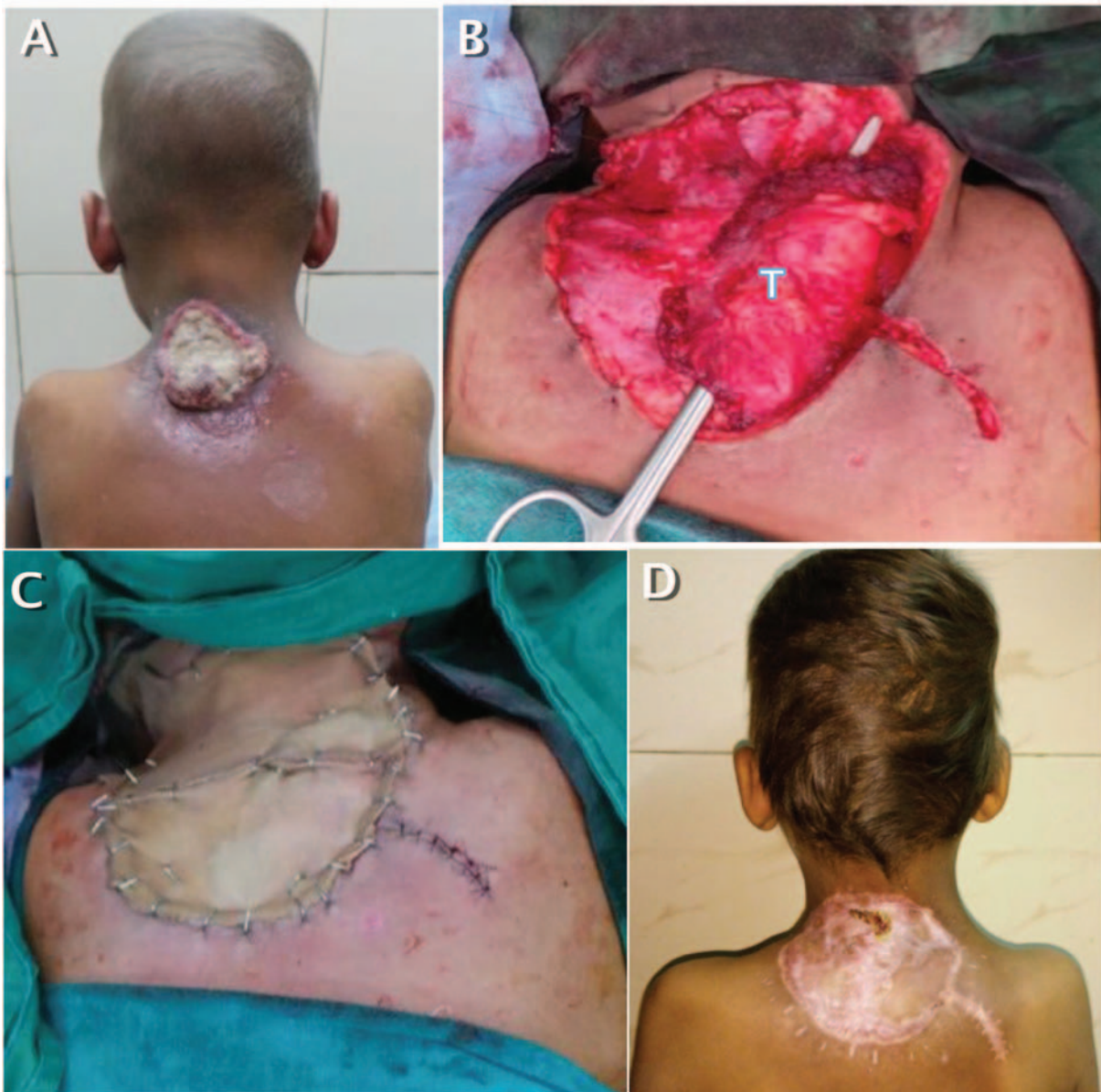
Fig. 4 Image showing (A) rhabdomyosarcoma over the lower cervical and upper thoracic regions, (B) right trapezius muscle flap covering the spinous processes, (C) skin graft over the muscle flap and adjacent soft tissue defect, and (D) well-settled wound.

In all of the LTMIF patients, the lowermost portion of the flap crossed the tip of the scapula by around <5 cm. It was ensured that more than two-thirds of the skin paddle of the flap was overlying the trapezius muscle. It is well known that the dorsal scapular vessels supply the lower portion of the trapezius muscle and skin predominantly. Skin paddle as low as 10 to 13 cm below the scapula tip has been described (extended vertical flap design). 7 Urken et al 8 opined that the lower extent of the flap should not be >5 cm below the tip of the scapula when the flap is based exclusively on the transverse cervical vessels. Uğurlu et al 7 described that the lower border of the skin paddle could be harvested as low as 24 cm below the tip of the scapula in spite of transecting the dorsal scapular vessels. Can et al included both the transverse cervical vessels and dorsal scapular vessels in the flap and achieved good results. 9 We also feel that the exclusion of