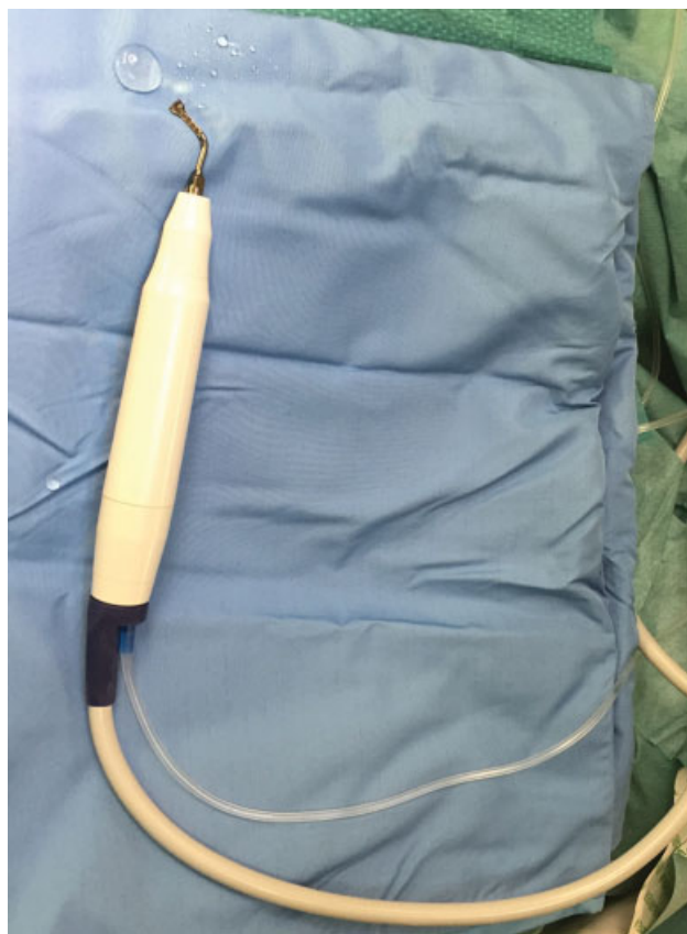
Fig. 2 Sterile piezoelectric handpiece connected to the main unit.

power with sterilizable holders for the handpiece and irrigation fluids. It contained a peristaltic pump for cooling with a jet of saline solution that discharges from the insert with an adjustable flow of 0 to 60 mL/min and removes detritus from the cutting area. This allowed a precise cut and a good visual control of the surgical field. The setting of power and frequency modulation of the device can be selected on a control panel with a digital display. For the handpiece several autoclavable tooltips, called “inserts,” are available ( ►Fig. 3 ).