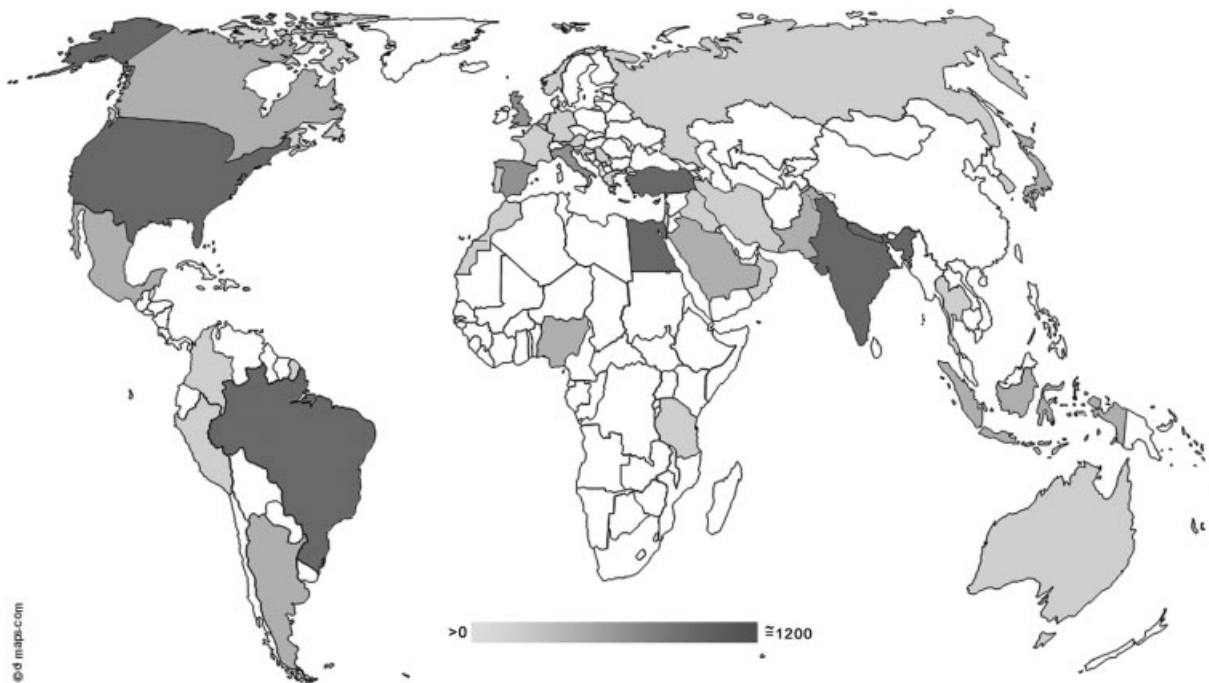
Fig. 3 Distribution of articles published by authors from 40 countries.