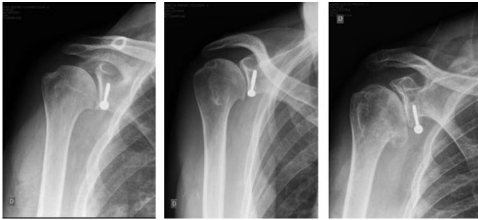
Fig. 2 Degree of shoulder arthropathy.