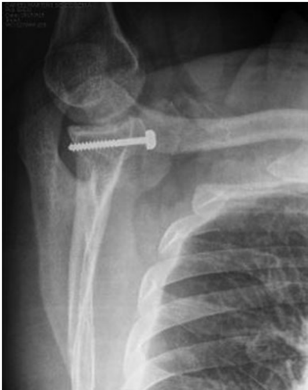
Fig. 5 Shoulder Xr in the Bernageau and Patte 24 incidence. The length of the screw, the position parallel to the glenoid, and the consolidated graft are observed.

Gordins et al. 22 reported that their arthropathy numbers in anterior shoulder dislocation are possibly inferior to those that could be expected, and they emphasized that arthropathy seen through the AP and axial incidences related to