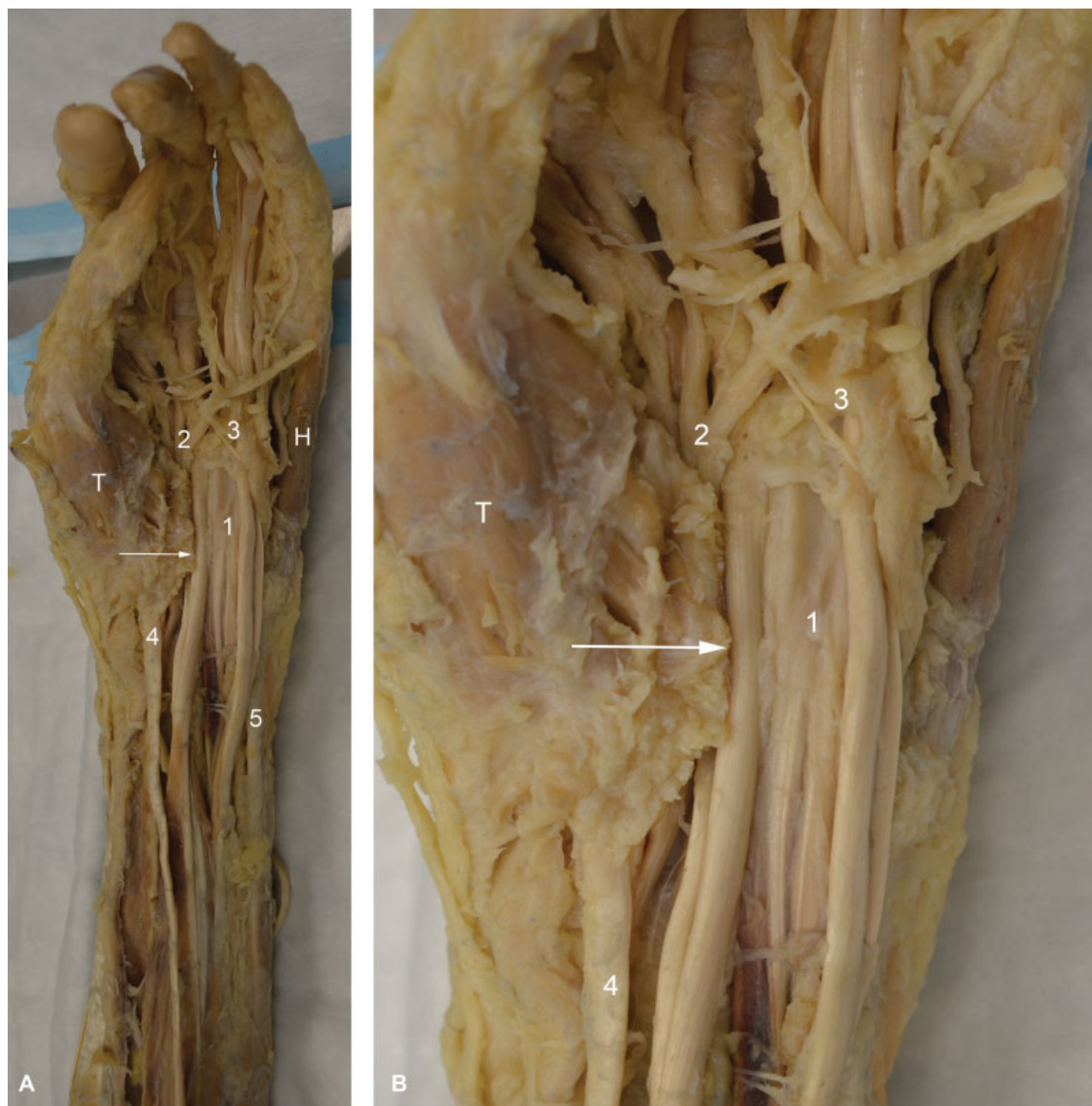
Fig. 1 (A) Dissection of the palmar aspect of the left hand and forearm. Only tendons of flexor digitorum superficialis (FDS; 1) were visible once the flexor retinaculum (transverse carpal ligament) was opened. The median nerve, while not visible in the carpal tunnel, its branches (2) appeared distally toward the radial aspect of FDS and crossed medially superficial to FDS along with the superficial palmar arch (3). (4) represents flexor carpi radialis and (5) is the flexor carpi ulnaris. H, hypothenar muscles; T, thenar muscles; arrow, cut end of the transverse carpal ligament. (B) Magnified view of A.

When the FDS tendons were separated, the median nerve was found to have another 180-degree spin around itself proximal to the carpal tunnel deep to FDS, thus completing a 360-degree spin (►Fig. 2A). An interfascicular dissection was then performed to separate the palmar recurrent branch. This was found to be on the medial aspect of the median nerve in the proximal carpal tunnel, and then it travels on the deep surface of the median nerve to head laterally toward the thenar muscles in the distal carpal tunnel (►Fig. 2B). We completed the dissection by exposing the median nerve in the cubital fossa and the upper forearm (►Fig. 3).