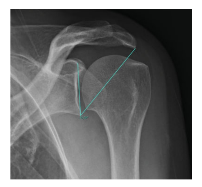
Fig. 2 Measurement of the CSA by radiography.

The data were blindly and randomly evaluated by three evaluators, one fellow in shoulder surgery, a shoulder specialist with three years of experience, and a musculoskeletal