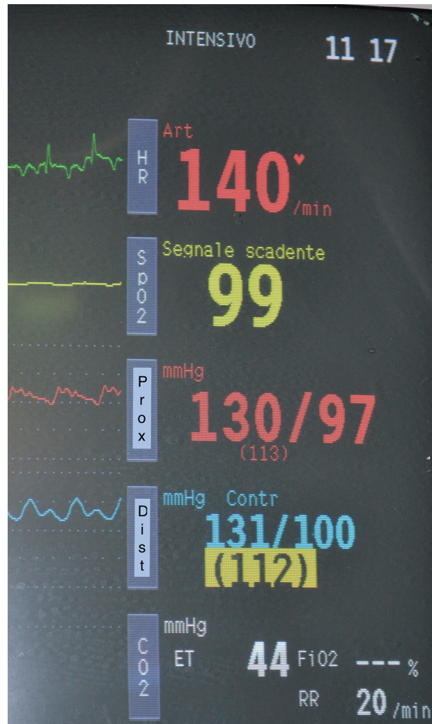
Fig. 3 Invasive blood pressure at the end of the hybrid procedure to show the same arterial pressure in the proximal and distal part of the prosthesis.

Under fluoroscopy, graft deployment was successful, and radio-opaque markers were useful to identify and position the surgical segment at the correct thoracic and abdominal aorta height in all five animals. Once the abdominal aorta was incised and the surgical prosthesis zone was exposed to enable partial crossclamping, no bleeding was noted from the exposed surgical field. At the end of the surgical procedure, no major bleeding or cardiac events occurred.