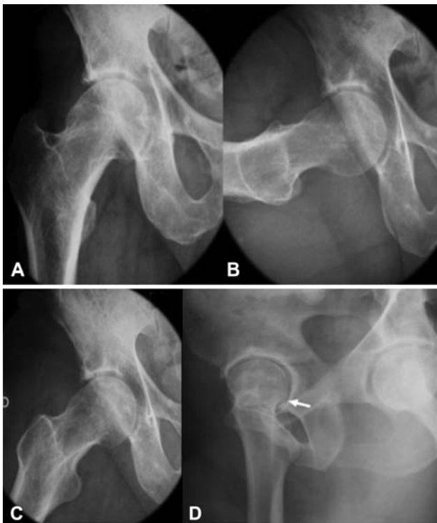
Fig. 3 Radiographic hip views in FAI research. (A) Anteroposterior view. (B) Ducroquet view. (C) Dunn view for the visualization of neck-type deformity. Note the rectification and prominence of the neck-head transition region. (D) X-ray image in Lequesne position.

Errors in performing AP pelvic radiography are frequent and may compromise the diagnosis. Anteroposterior radiography of the pelvis is performed with the patient in dorsal recumbency, with the lower limbs at 15° medial rotation. 37 The distance between the film and the x-ray tube should be 120 cm, and its cross-over mark should be centered midway between the upper edge of the pubic symphysis and a line connecting both anterosuperior iliac spines. 37 Acetabular morphology on AP pelvic radiographs is influenced by pelvic rotation and inclination, which may vary considerably according to the patient's position during the examination. 40