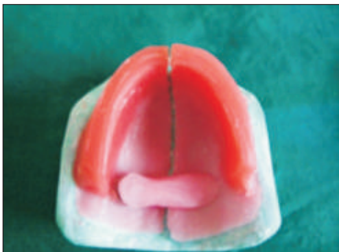
Fig 5: occlusion rims in two sections