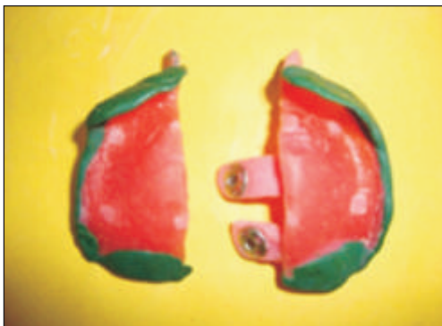
Fig 3: Border molding in sections