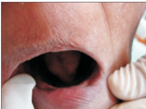
Fig 1: Limited mouth opening

A treatment provided for a compromised patient with which there will be a change in appearance and function would be one of the best gifts to her as she will develop self confidence and the social status would improve a lot and the patient will be ever grateful for the treatment given. No condition is impossible to treat if slight modifications can be thought of in the methods of treatment.