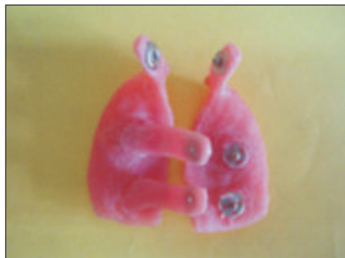
Fig 2: Sectional impression tray with snap fit pins