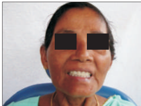
Fig 6: Post treatment view