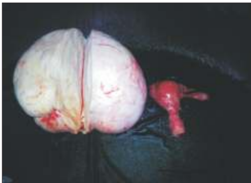
Fig. 3: Ovarian Fibroma specimen