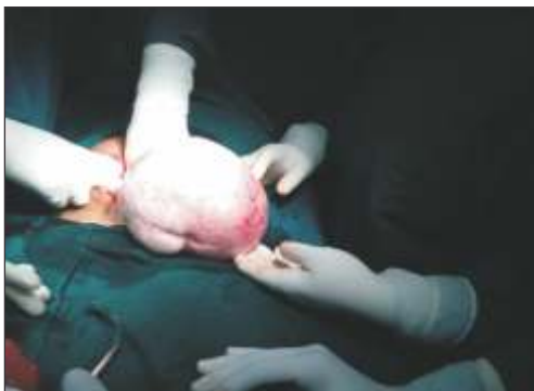
Fig. 2: Ovarian Fibroma seen during surgery