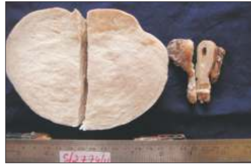
Fig. 4: Cut Section