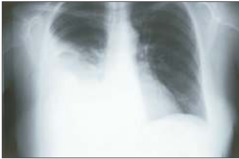
Fig 1: Chest X-ray showing right pleural effusion