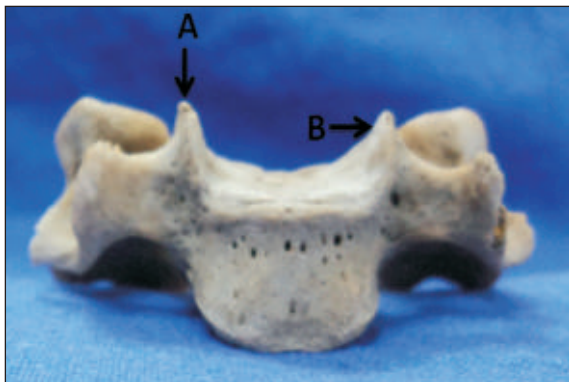
Figure 3. Anterior surface of cervical vertebra showing A- Uncus, B- Articulating facet.