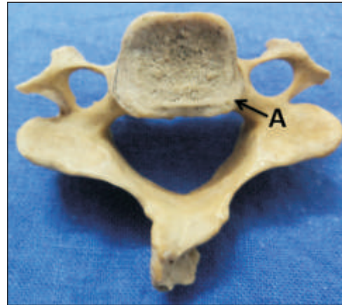
Figure 2. Superior surface of cervical vertebra showing A-Beveled inferolateral surface.