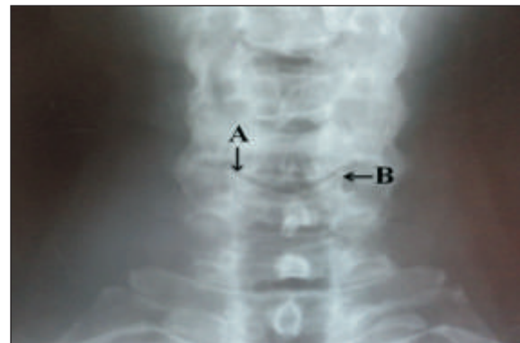
Figure 4. Anteroposterior view of x-ray of neck showing A- Uncus, B- Uncovertebral joint.