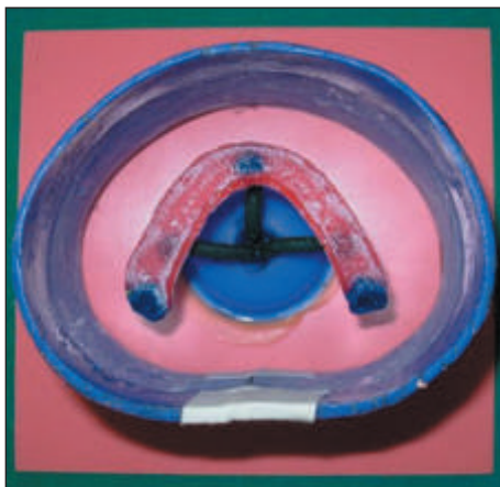
Figure 3 - Investing