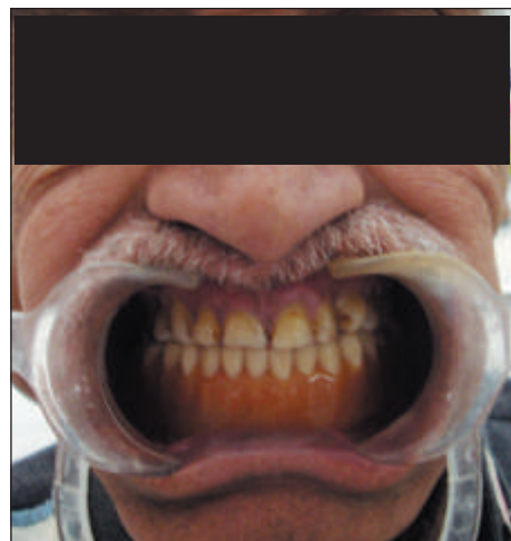
Fig 7 - Happy Patient

lead flexure of the denture bases 5 . The midline fracture in a denture is often a result of flexural fatigue. Though poly Methyl Metha Acrylate denture bases have good mechanical, biological and esthetic properties, the impact and fatigue strength of PMMA are not entirely satisfactory ,thus may fail when there is excessive parafunctional and/or functional forces 6,7 .