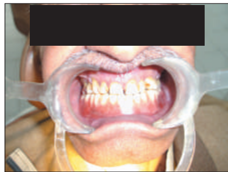
Fig 4 - Try In