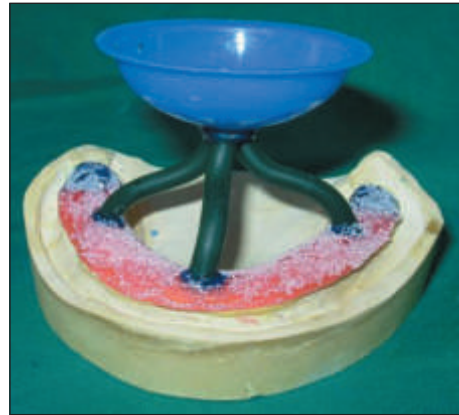
Figure 2 - Wax Pattern