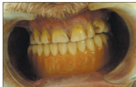
Fig 6 - Postoperative Photograph