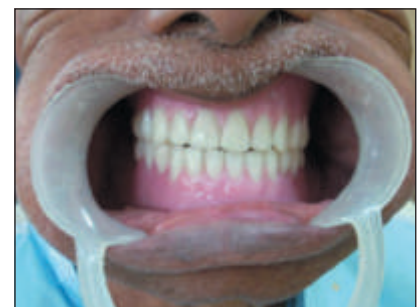
Figure 12 Happy patient