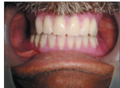
Figure 6 Postoperative photograph