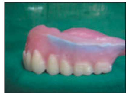
Figure 9 Cured denture