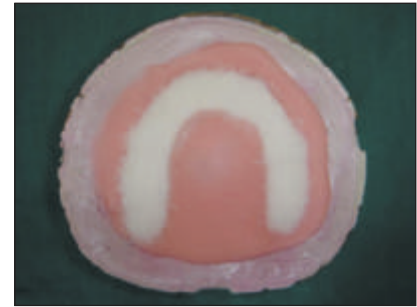
Figure 3 salt placement over heat cure