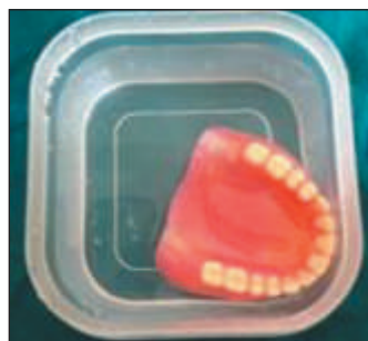
Figure 11 Hollow denture