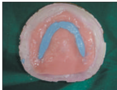
Figure 8 Putty placement