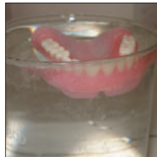
Figure 5 Hollow denture