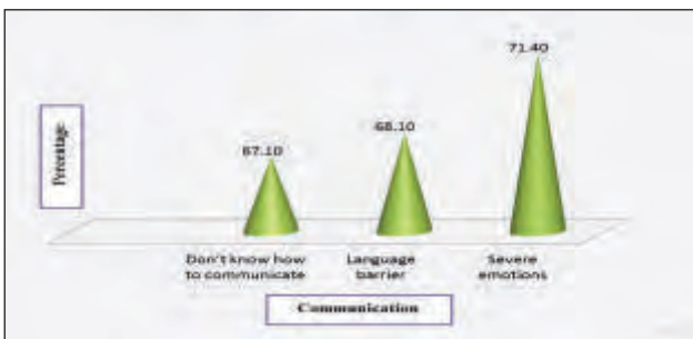
Fig 3: Challenges perceived by nursing students on death and dying (n=210)