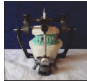
Fig. 4 : Mounted diagnostic casts.