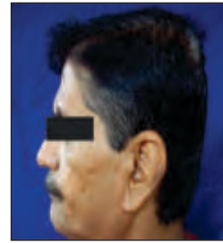
Fig. 2 b : profile view