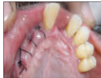
Fig. 8b : Maxilla