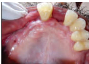
Fig. 10 a : One week post op maxilla