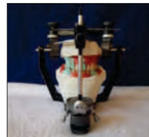
Fig. 6 : Waxed up casts