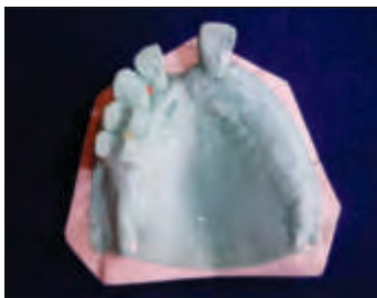
Fig. 5a : Modified cast - Maxilla