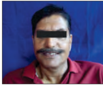
Fig. 2 a : Pre op frontal view