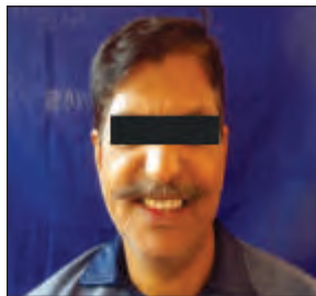
Fig. 7 : Immediate post op