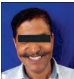
Fig. 9a : one day post op frontal view