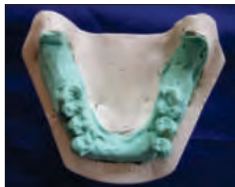
Fig. 5b : Mandible