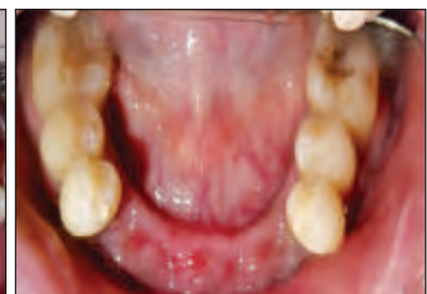
Fig. 10 b : Mandible