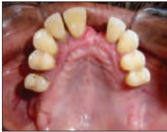
Fig. 3 a : Intraoral Maxilla