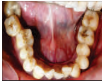
Fig. 3b Mandible