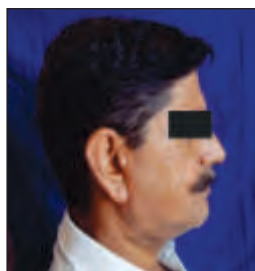
Fig. 9b : profile view