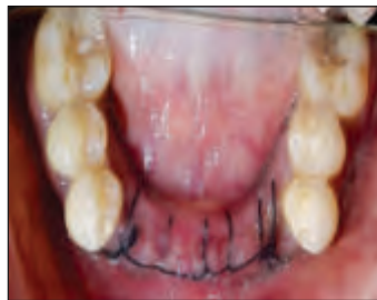
Fig. 8 a : One day post op intra oral mandible