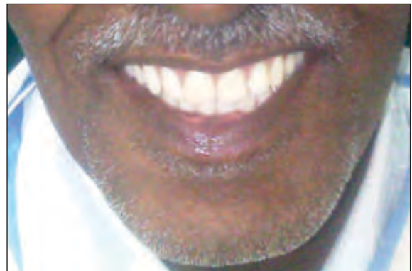
Figure 6 : Postoperative Photograph

cheeks. Since these forces were developed through muscular contraction during the various functions of chewing, swallowing they vary in magnitude and direction in different individuals. 2 When the residual alveolar ridges have resorbed significantly, denture stability and retention are more dependent on correct position of teeth and contour of the external surfaces of dentures. Keeping these factors in mind, neutral zone method was used for this particular case. The advantage of this method is that the changes that might occur in vertical dimension during recording of the neutral zone can be prevented by the