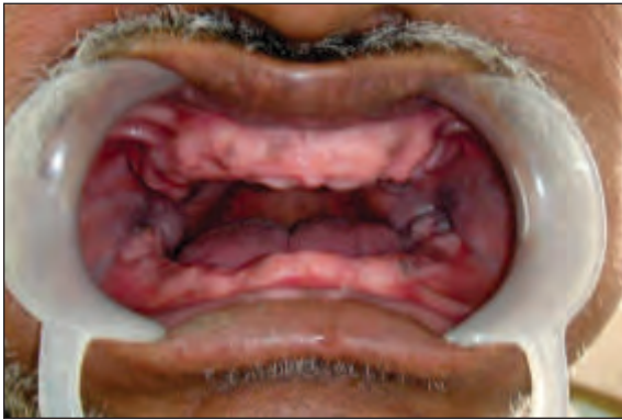
Figure 1 : resorbed Ridges