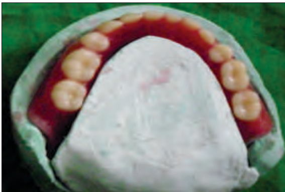
Figure 5 : Teeth Arrangement