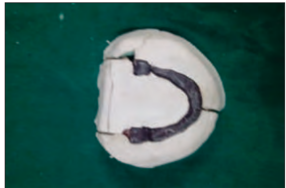
Figure 4 : Plaster Index