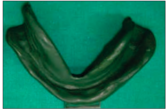
Figure 2 : Admixed Mandibular Preliminary Impression