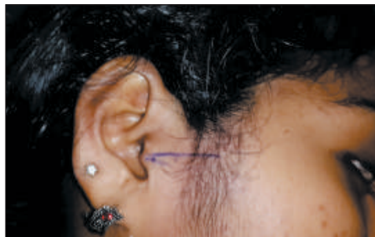
Figure 3 : Markings according to McCains Protocol