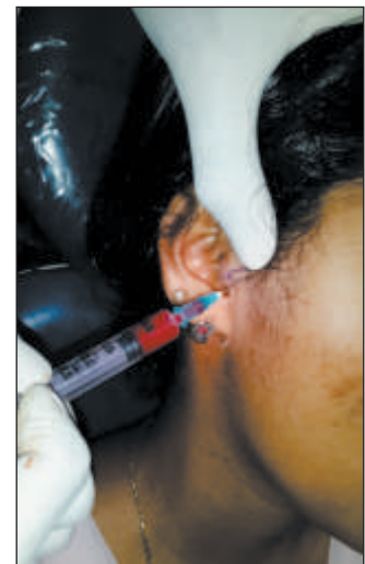
Figure 4 : PRP Injection in upper joint Space of TMJ