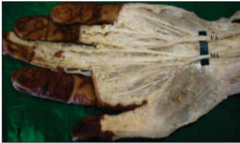
Figure 1 : Showing Left Unilateral Persistent Median Artery (Ua – Ulnar Artery, Ma – Median Artery)