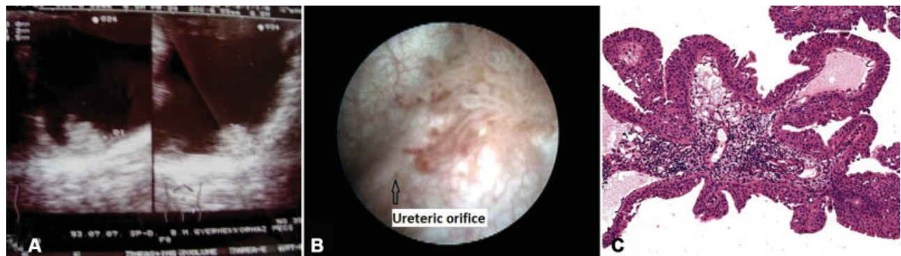
Fig. 1 On ultrasound scan, a 15 \times 15 mm, solid, hyperreflective, solitary lesion was detected in the urinary bladder next to the orifice of the left ureter. (A) During urethroscopy, a typical uroepithelial papilloma was detected next to the left ureteral orifice. (B). Histological finding was uroepithelial papilloma. (C) Case 1.

Laboratory and urine tests were negative. The US showed an 18 \times 20 \times 21 mm large, lobulated, hyperreflective lesion adjacent to the orifice of the right ureter. A magnetic resonance imaging (MRI) examination was made to clarify the extent of the neoplasm. It featured a local lesion without any sign of infiltration. Urethroscopy revealed a papillary tumor in the vicinity of the bladder, which was resected with the use of a diathermy, through a 11.5 Fr resectoscope. The histological examination revealed urothelial papilloma (R1 resection).