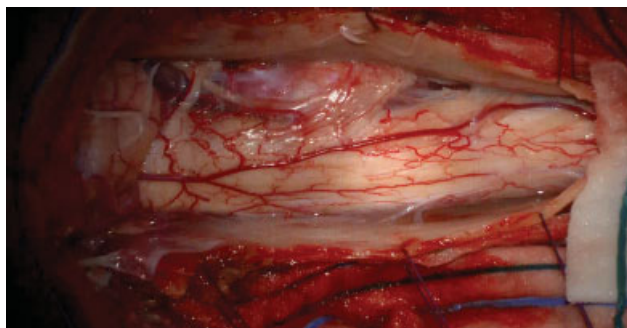
Fig. 2 Surgical field after suboccipital craniotomy and C1-C3 laminectomy.