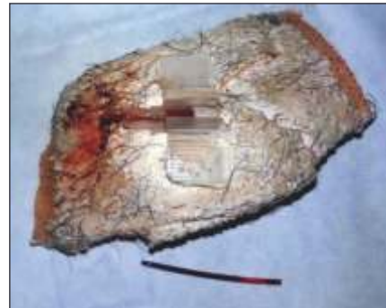
Figure 5 : Fractured IV cannula

embolization of catheter fragments in 1954 as a complication of central venous catheterization. There are two reports regarding embolism of fractured peripheral IV cannula in the literature. Cannula fracture is uncommon and usually occurs during insertion and removal.