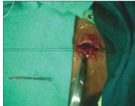
Figure 4 : Cannula Retrived