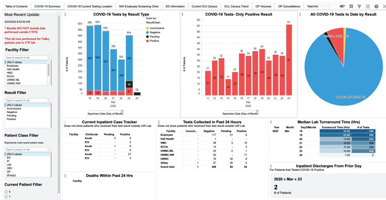
Fig. 2 COVID-19 incident command dashboard. UW Medicine IT services created a dashboard for our COVID-19 hospital incident command. A list of metrics collected can be found in Table 1 .