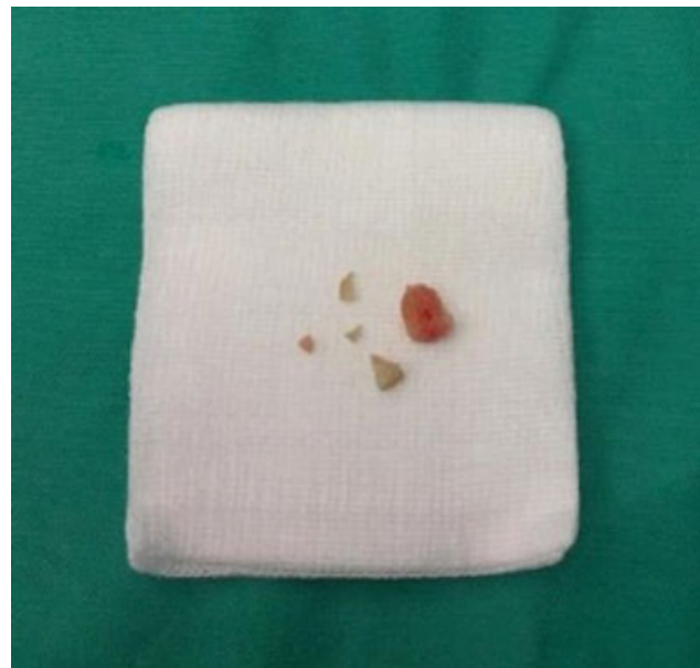
Fig. 2 Pieces of peanuts lodged in right bronchus retrieved.