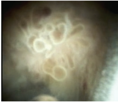
Fig. 2 “Fish egg” appearance on pancreatoscopy using Spyglass system.

cholangitis, a third ERCP was done after 5 days from the second ERCP. Mucus plug was noted at ampulla and previous stent appeared to be plugged with mucus. A 10 Fr nasobiliary drain (COOK) placed in the CBD and N-acetylcysteine (NAC) was instilled (4,000 mg NAC in 500 mL NS); 100 mL of NAC was flushed every 3 hours. He was also continued on broad-spectrum IV (intra venous) antibiotics. With these measures we noticed a steady decline in the hyperbilirubinemia and our patient reported clinical improvement of symptoms. However, his symptoms were not completely resolved. He underwent open cholecystectomy with placement of a T-tube through which infusion of acetylcysteine was continued while he was in the hospital for an earlier resolution before definitive surgery. Subsequently, he was discharged and continued on nutritional rehabilitation. On follow-up after 1 week, his liver function tests had normalized. He was subsequently taken up for Whipple’s resection. The resected specimen showed intraductal papillary mucinous neoplasm of pancreas (intestinal type) with low- and high-grade dysplasia and microinvasion, against a background of severe chronic pancreatitis. He was asymptomatic at follow-up of over 1 year.