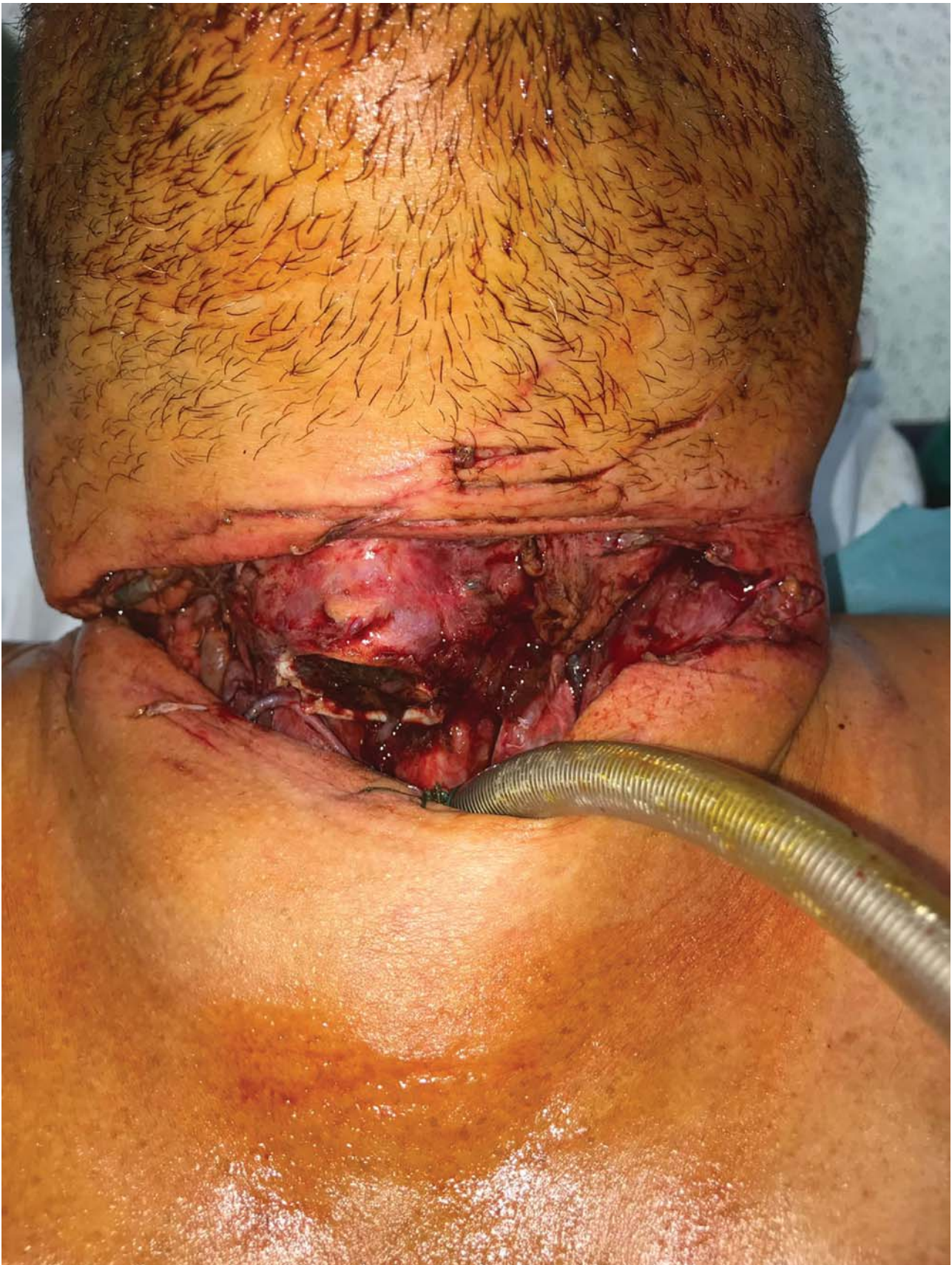
Fig. 3 Intraoperative situs of the wound. The trachea is completely dissected; however, despite the severe trauma, no major vessels were damaged.