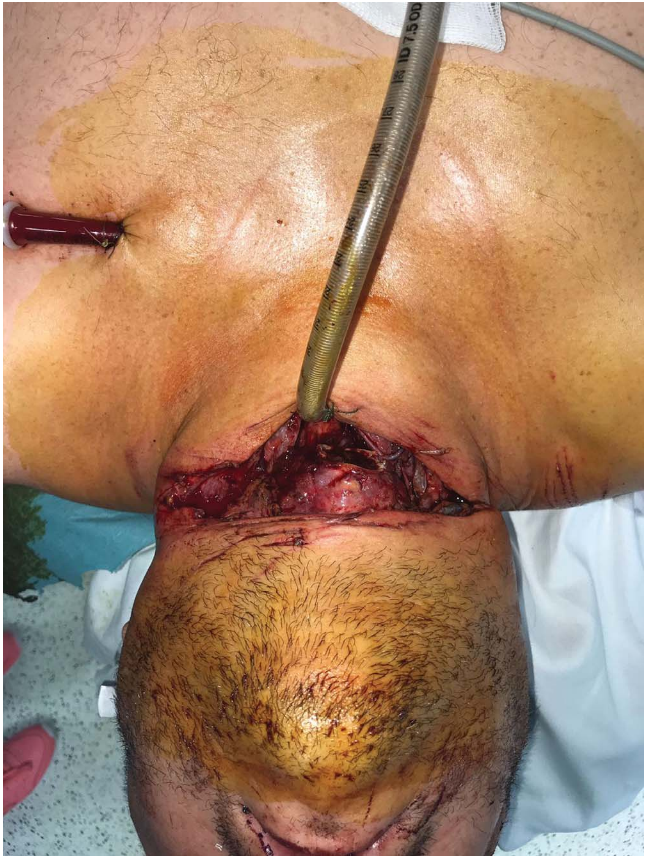
Fig. 2 A 15-Fr cannula inserted into the left subclavian vein for ECLS support. The endotracheal tube (ET) is fixed with gauze bandages and a cervical collar. ECLS, extracorporeal life support.