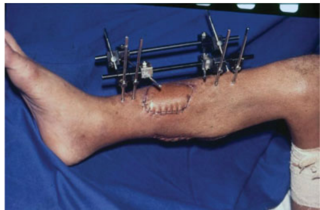
Fig. 5 Postoperative image.