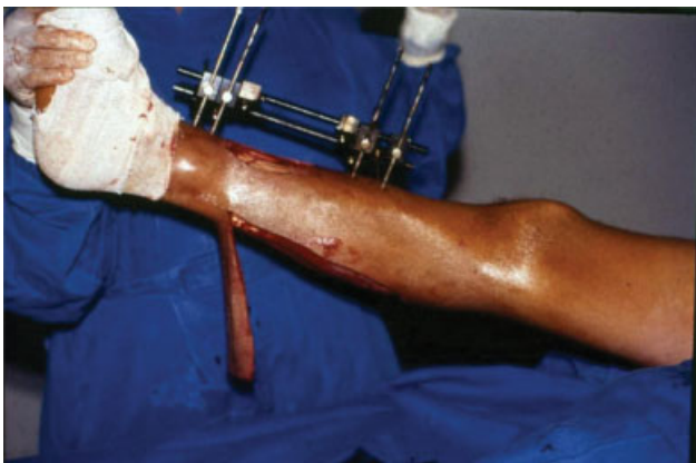
Fig. 3 Surgical image.