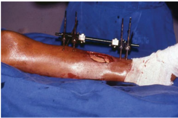
Fig. 2 Preoperative image.