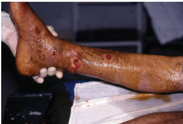
Fig. 7 Preoperative image.

offering good skin coverage and subcutaneous tissue for