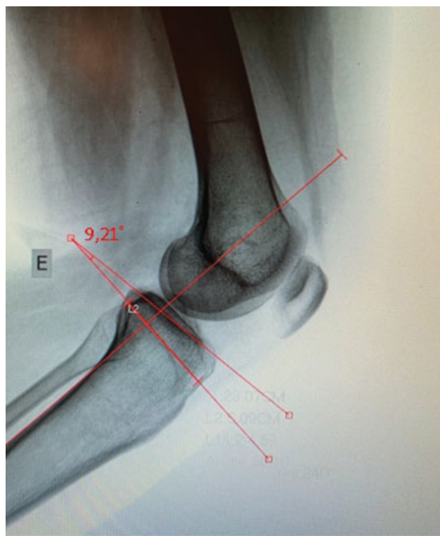
Fig. 1 Demonstration of measurement of posterior tibial inclination.

A Receiver Operating Characteristic (ROC) curve was built to identify the best cutoff point for posterior tibial slope for