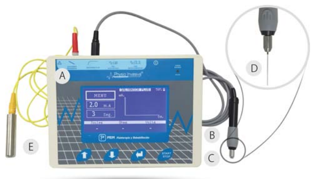
Fig. 2 Medically certified device (Physio Invasiva®, PRIM Physio, Spain). (A) Device. (B) Cathode (modified electro-surgical scalpel with the needle). (C) Needle holder. (D) Needle. (E) Anode (handheld electrode).

the needle) while the patient held the anode (handheld electrode). A GE Logiq E9 ultrasound machine with a ML6–15 lineal transducer (GE Healthcare, Wisconsin, USA) was used. During PNE intervention, the player was placed in the prone position with his feet outside the table. Prior to inserting a needle, the underlying skin was cleaned with isopropyl alcohol and chlorhexidine (Lainco® 2%). The transducer enclosed in a non-sterile rolled latex covers with non-sterile ultrasound gel was placed on the target area. Subsequently, an acupuncture needle 0.30 mm × 50 mm (Physio Invasiva® needles, PRIM Physio, Spain; uncoated steel needle with rigid metal handle with guide, Korean type) was inserted using a short axis approach, perpendicular to the surface of the skin, until the muscle injury according to the technique described by Valera & Minaya (→Fig. 3). 23 A physiotherapist with over 10 years’ experience in ultrasound evaluation and 15 years’ experience in invasive therapy applied the PNE technique. Oral paracetamol was used when necessary for the purpose of pain relief in the first 24 hours after PNE intervention.