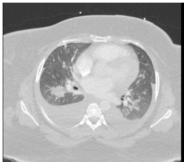
Fig. 2 Computed tomography angiogram of the chest depicting scattered air space consolidation in bilateral lung fields with associated bronchial wall thickening suggestive of an infectious etiology, moderate volume pleural effusions (right > left), compressive atelectasis, and no evidence of pulmonary thromboembolism.