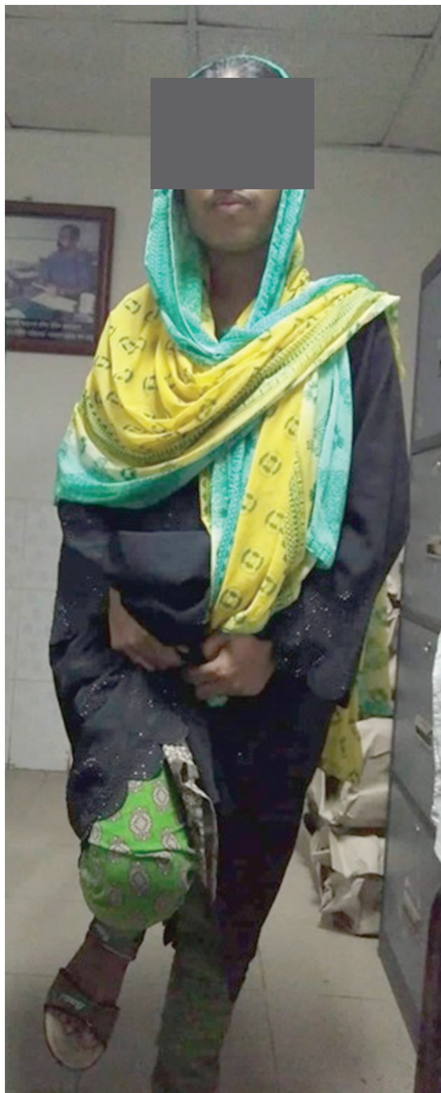
Fig. 3 After one month of operation, patient can walk independently.

further damage of neural structure and stabilize with the help of sound arthrodesis. Clinically, the patient improves significantly, indicating adequate stabilization.