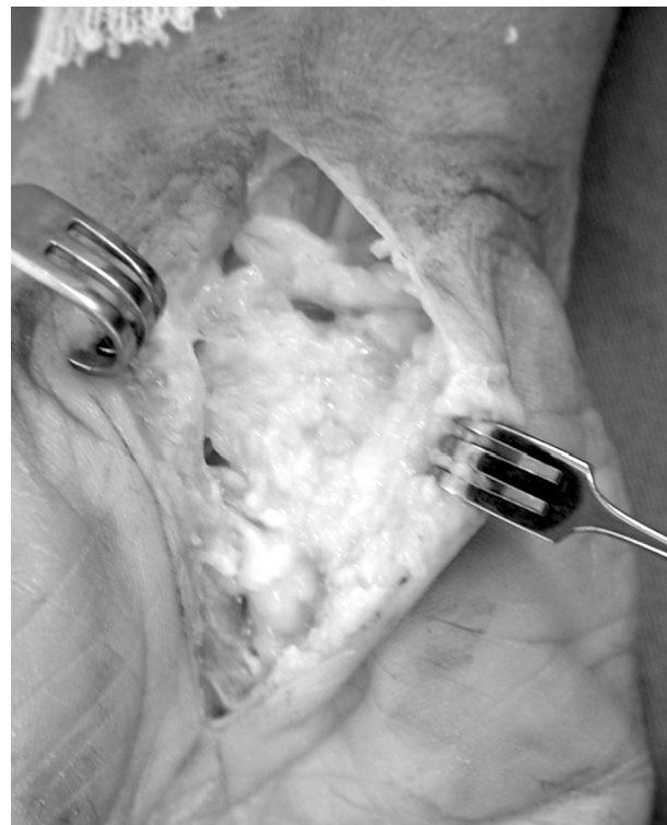
Fig. 3 An hypothenar fat pad flap was performed to interpose adipose tissue from the hypothenar eminence between the median nerve and overlying transverse carpal ligament and surgical scar.

The concept of vein interposition, placing the vein around the median nerve as a barrier to prevent scarring, was originally described in rats but it has been used clinically. 48,50 The surgical technique consists of releasing the median nerve from cicatricial adhesions and identifying the region to be covered by a vein. After harvesting 25 to 30 cm, the saphenous vein is opened longitudinally. With the