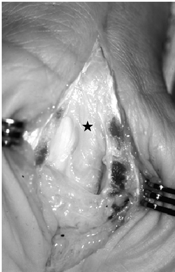
Fig. 2 Open approach to allow visualization of potential residual compression sites and adhesions around the median nerve (star).

may compress the median nerve must be removed at this surgical stage (► Fig. 2 ). Any totally or partially damaged nerve site must be repaired with a nerve graft. Ulnar nerve decompression in the Guyon canal can be performed if required. 5