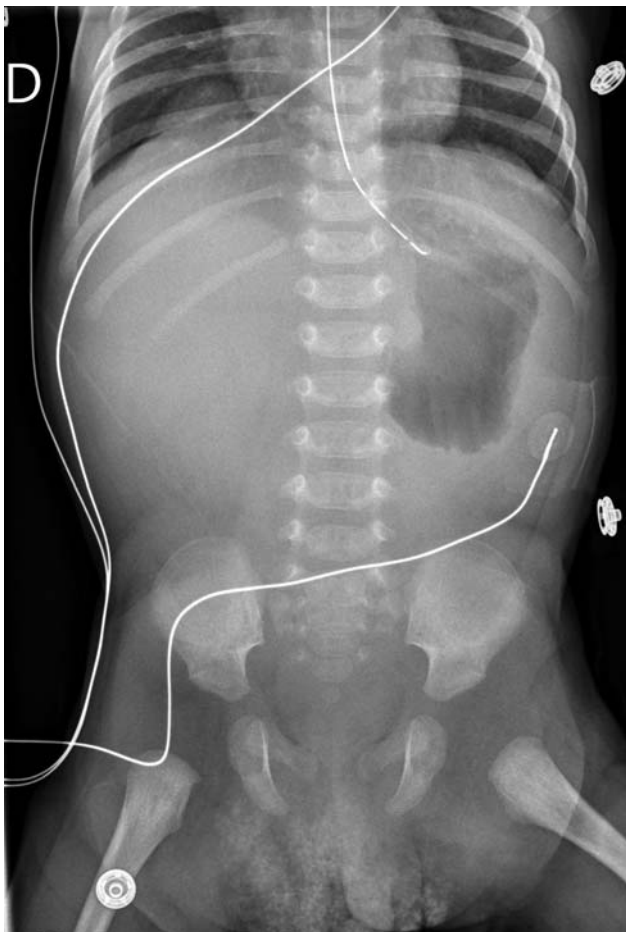
Fig. 1 Dilated stomach at 5 weeks of age.

The 5.5-week-old boy was finally taken back to the operating room (OR) for an open explorative laparotomy, during which a single 5-mm trocar was inserted into the