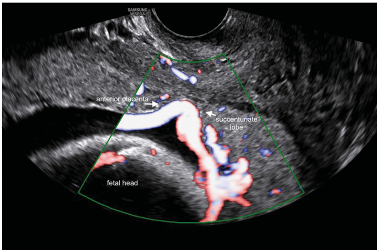
Fig. 2 Use of color Doppler allowed the visualization of a vascular structure (vasa previa) that crosses the internal orifice of the cervix, connecting the separate succenturiate lobe to the main portion of the placenta. The arrows indicate the placental limits of both lobules closest to the internal os.