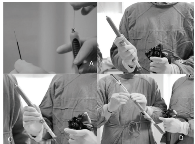
Fig. 1 (A) Needle, sheath, and stylet can be seen; (B) Lower three fingers of hand acts like a lock and thus prevent overshoot of needle; (C) Needle lock is used (in place of fingers); (D) Use of suction syringe.

cells from tissue. Suction is generally needed in fibrotic/calcified nodes, post-treatment tubercular nodes, and in necrotic lesions. The FNA needle remains filled with air during standard suction method. The use of suction has been shown to be effective in some studies, but not in all. 15,19-22