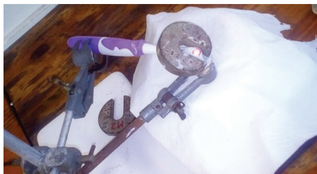
Fig. 1 Brushing protocol apparatus setup.

Before brushing, the samples were kept in artificial saliva (► Table 1) for 5 minutes to simulate oral condition. One half of the tooth was then protected with aluminum tape. Tooth brushing was performed using a powered 1.5v alkaline battery (Oralwise, China) of medium brittle hardness and a nylon filament for 2 minutes prior to washing with deionized water. Using 100 mg of each respective toothpaste and at room temperature, it was then brushed (► Table 2). The EB@TiO 2 slurry and toothpaste were set by mixing 10 mg