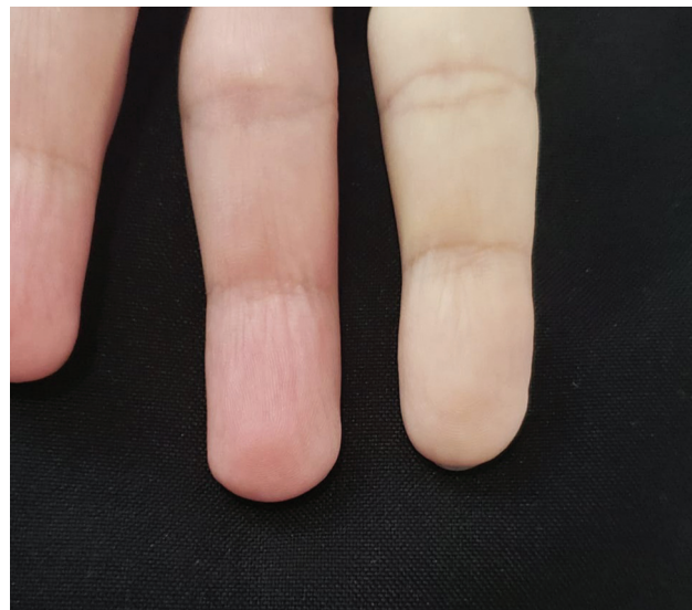
Fig. 1 Preoperative clinical aspect showing poor perfusion of the index and middle fingers.

On the first postoperative day, the patient already reported significant improvement in pain and paresthesia but maintained a slower perfusion and a cold sensation in the 2 nd finger. After 7 days, the perfusion was already normalized, with no difference in sensitivity, color or temperature of the affected finger compared with the others (► Figure 4 ).