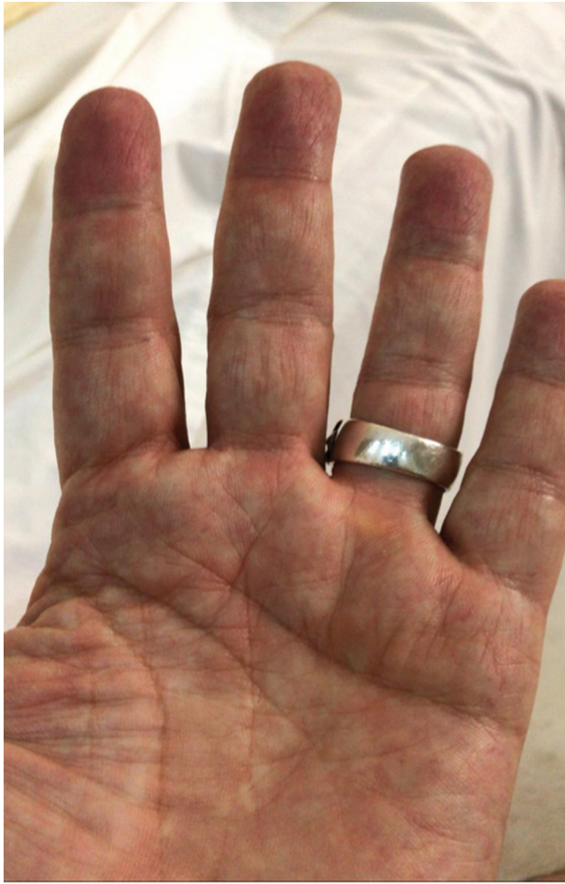
Fig. 4 2 nd finger perfusion fully restored 1 week after surgery.

Despite being dominant in the embryonic phase, the median artery, when it persists, presents itself as a remnant, without significant repercussion on the vascularization of the hand. 5 We did not find, in the literature, a report of the dominant median artery related to carpal tunnel syndrome. The treatment instituted in this case differed from previous