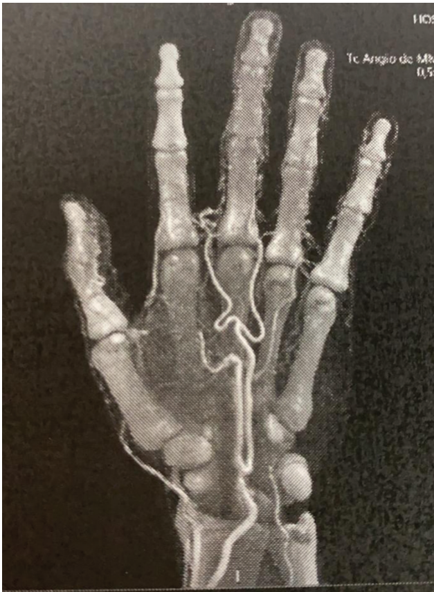
Fig. 2 Angiotomography showing persistent and dominant median artery. Reduced perfusion on the 2 nd finger.