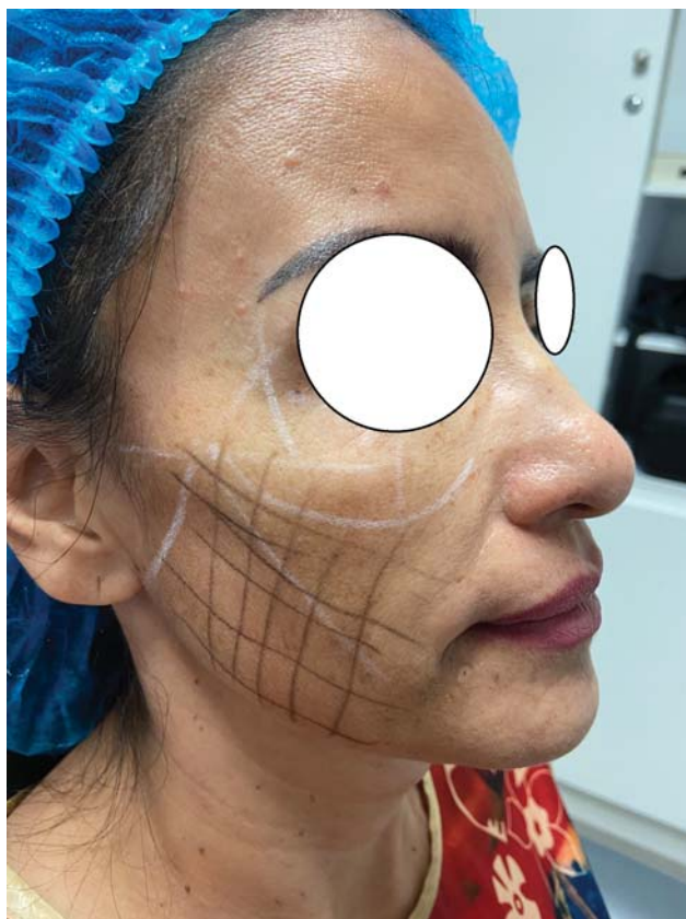
Fig. 3 Mesh procedure is usually done with smooth threads. A mesh is drawn in black creating a net where smooth threads will be introduced creating a subcutaneous mesh that stimulates collagen production. A similar mesh can be placed along the jawline in the temporal area and in the neck.