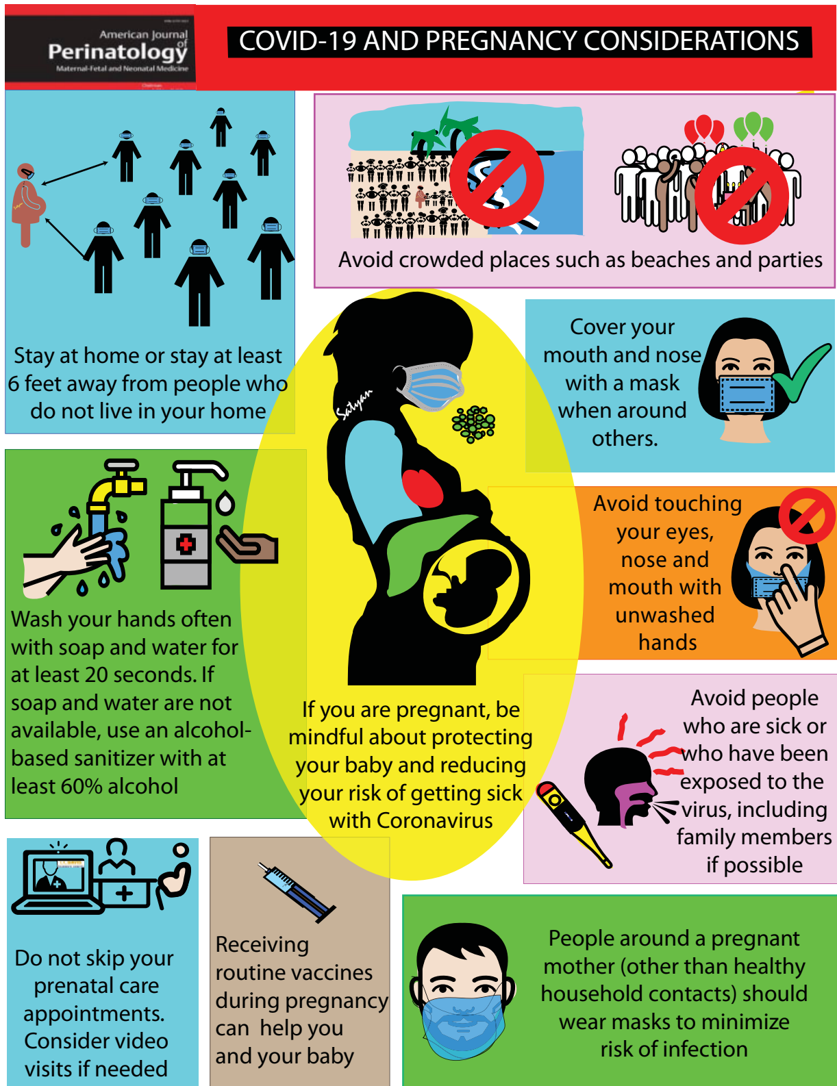
Fig. 1 COVID-19 and pregnancy considerations: general guidelines for use of masks, physical distancing and avoiding crowds, hand hygiene, and antepartum care are shown. COVID-19, coronavirus disease 2019.

Copyright © Satyan Lakshminrusimha. Readers are welcome to use this infographic as poster, slide, or brochure for patient, parent, and trainee education.