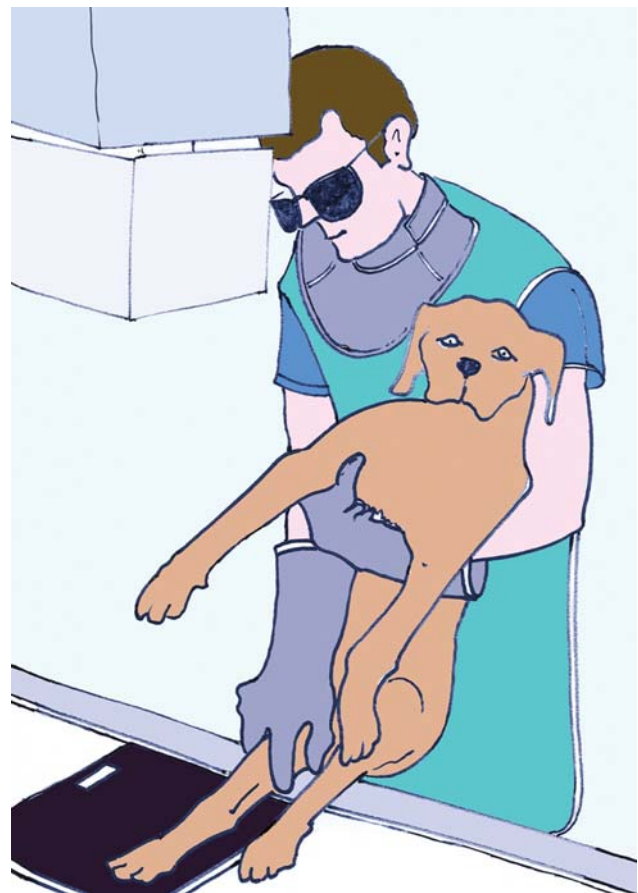
Fig. 1 Cartoon drawing demonstrating manual restraint and positioning to perform the dorsoplantar radiographic view of the tarsus in these dogs. (Artist: Flaminio Addis; copyright Francesca Briotti, 2003) Source: Modified and reprinted with permission from Petazzoni M. Metatarsal rotation in the dog – Early diagnosis. Proceedings of the 2009 American College of Veterinary Surgeons Veterinary Symposium; October 8–10, 2009; Washington DC; pp 327–329.

Bilateral dorsoplantar radiographic projections of the hock were obtained. All puppies were physically restrained (without sedation) in a sitting position (► Fig. 1). A malformation of the central tarsal bone was defined as a large curved bone that appeared to be an extension of this bone on its medial side, or the presence of separate ectopic bone located medially to the central tarsal bone, talus and second metatarsal bones (► Fig. 2). Appearance of ectopic bone formation was defined as an extra ossification site. For each tarsus, malformation of the central tarsal bone and the number and location of ossification sites medial to the central tarsal bone, talus and 2nd metatarsal bones were recorded; furthermore, any supernumerary digits or abnormalities of the metatarsal bones were noted. For the purposes of this study, these findings were consistent with our definition of affected versus non-affected dogs (► Fig. 2).