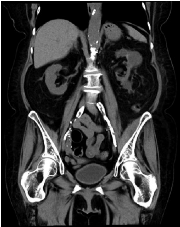
Fig. 1 Coronal view of a noncontrast computed tomography scan of the abdomen and pelvis in a patient with significant iliac occlusive disease (IOD) prior to kidney transplantation.

transplant team in 19 (86.4%) patients and in 3 (13.6%) patients by external providers. Follow-up is rigorous and requires good patient adherence: visits every 2 weeks in the first 2 to 4 months; then, monthly visits until the 6th month. Subsequently, visits every 2 months in the first year and every 3 to 4 months until the third year and lastly one visit per semester thereafter. During each follow-up visit, laboratory data are obtained for medication adjustments, if needed. If acute rejection is noted, plasma exchange and/or corticosteroids and/or immunosuppressant medication is initiated depending on the histologic grade of the rejection.