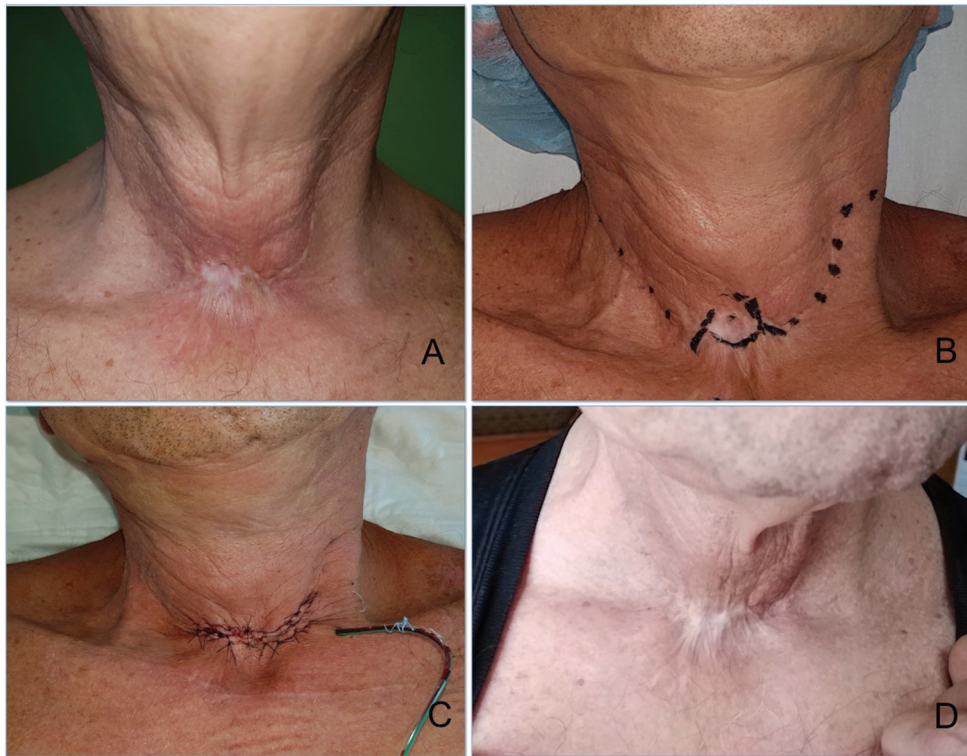
Fig. 2 (A) recurrent tracheocutaneous fistula after subtotal laryngectomy, radiotherapy and right neck dissection, and multiple closure attempts. (B) Preoperative markings: planned scarred skin excision around the fistula. Marked dots over previous neck surgical scars. (C) Immediate postoperative result. (D) Result at 20 months follow-up: excellent functional result without complications and a satisfied patient

the skin, also provides easy access to the trachea and the sternal and clavicular insertions of sternocleidomastoid muscles.