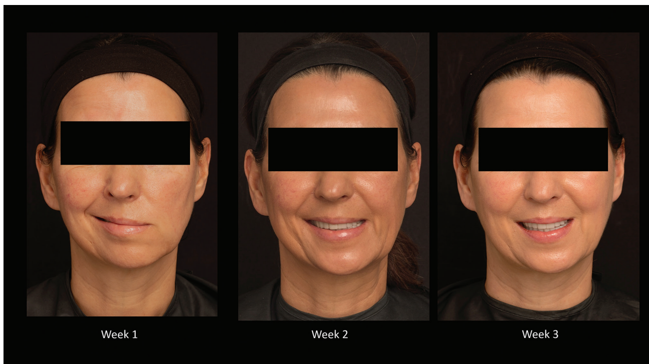
Fig. 3 Record of weekly recovery in a patient with Ramsey Hunt syndrome, demonstrating excellent recovery.

Facial paralysis is an intricate condition which may be exceedingly challenging to describe, measure, and follow-up. A recent comprehensive review of clinician-rated scales revealed no