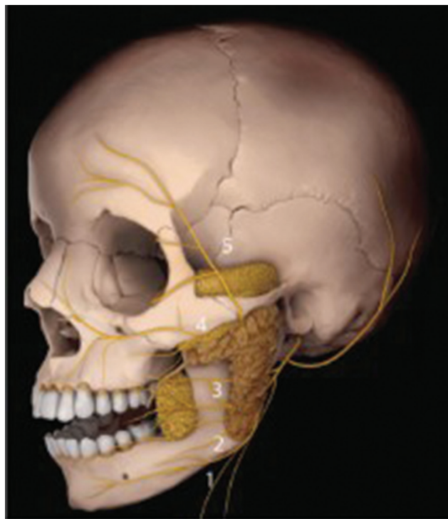
Fig. 2 Branches of the facial nerve VII, all of which may be affected by facial nerve paralysis (FNP). 5

ischemia are potential contributors to the development of Bell's palsy, the exact cause remains unclear and may be further elucidated by improved understanding of intra-axonal signaling molecules and the molecular mechanisms underlying Wallerian degeneration. 4 Recent guidelines