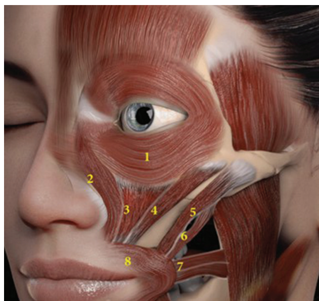
Fig. 8 Perioral muscles of animation. (1) Orbicularis oculi; (2) levator labii superioris alaeque nasi (LLSAN); (3) Levator labii superioris; (4) Zygomaticus minor; (5) Zygomaticus major; (6) Levator anguli oris; (7) Risorius; (8) Orbicularis oris (OO). 5

When treating patients with either BoNTA or HA fillers, it is imperative that injectors have a deep understanding of agonist and antagonist muscle groups, as levators and depressors work in opposition for normal, balanced facial expression (►Fig. 8). Understanding the position of the individual anatomical muscle layers is of paramount importance. While the optimal frequency of BoNTA treatment varies according to individualized needs, clinical practice verifies earlier studies