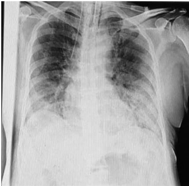
Fig. 2 X-ray of COVID-19 positive case.