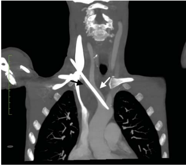
Fig. 1 Computed tomography angiography image, in coronal section, showing the course of the malpositioned dialysis catheter, after puncturing through the internal jugular vein (medial aspect). The catheter is seen to course through the right subclavian artery (black arrow), with the tip within the brachiocephalic trunk (white arrow).