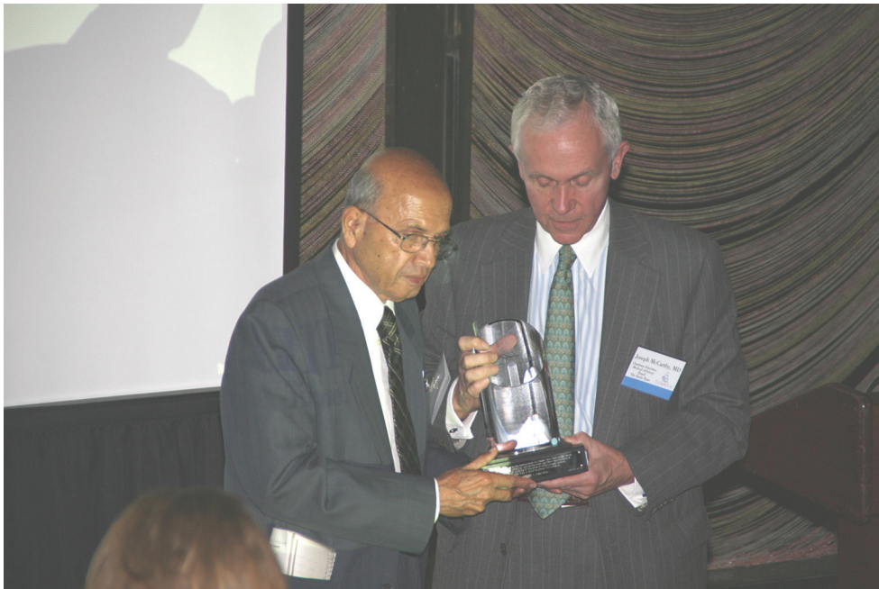
Fig. 7 Receiving the Joseph McCarthy Award.

ardent cricketer in his early days, being an opening batsman and a wicketkeeper for his university team. He was also a golfer (until a few years ago), and another passion of his was poetry (he could recite several long poems till his very end). He had high regard for Winston Churchill and Napoleon and never tired of reading books on them (► Fig. 6).