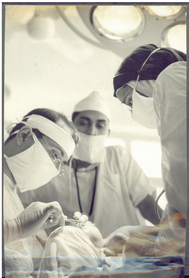
Fig. 3 In his operation theater in the early days.

cut ends of the midclavicular fractures, creating a nonunion and enabling early ambulation in these patients.