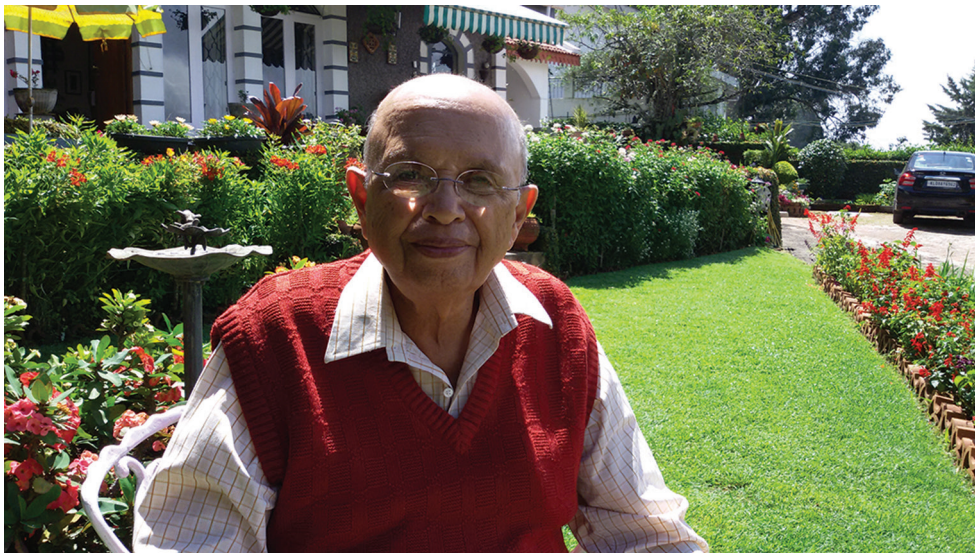
Fig. 6 Relaxing in his garden.