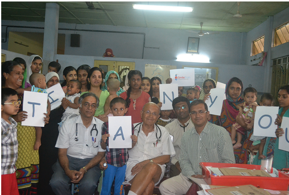
Fig. 4 With his patients.

He pioneered one of the most aggressive forms of septal corrections in primary cleft lip repair. In fact, through numerous publications and presentations at important conferences, he also encouraged other surgeons in the country and abroad to treat the unilateral cleft lip nose deformity during the primary repair. For microform cleft lips, he devised a technique called the Cutaneous Millard's repair with minimal surgical intervention. 7