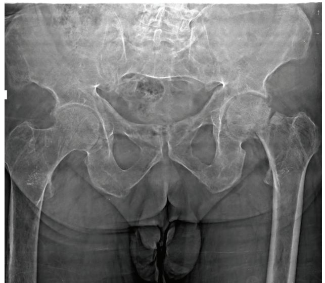
Fig. 4 The stress fracture of the left femoral head of Case 7.

in the 6th postoperative months had paresthesia, no sensory abnormality or pain was observed until the 12-month follow-up in any patient. The mean preoperative VAS score was 8.75 \pm 0.62 , and the postoperative VAS score at the sixth month was 1.17 \pm 0.72 . Statistical analysis of the 6th