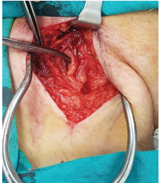
Fig. 3 Decompression of the lateral femoral cutaneous nerve.