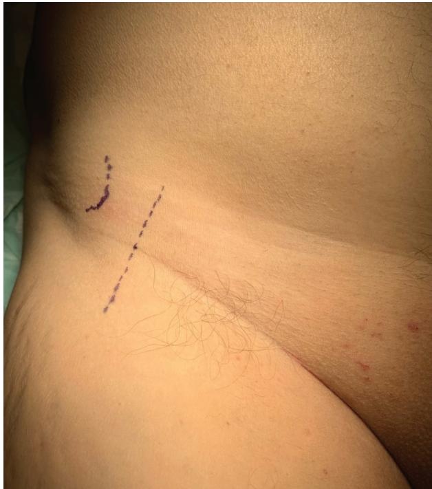
Fig. 1 The skin incision.