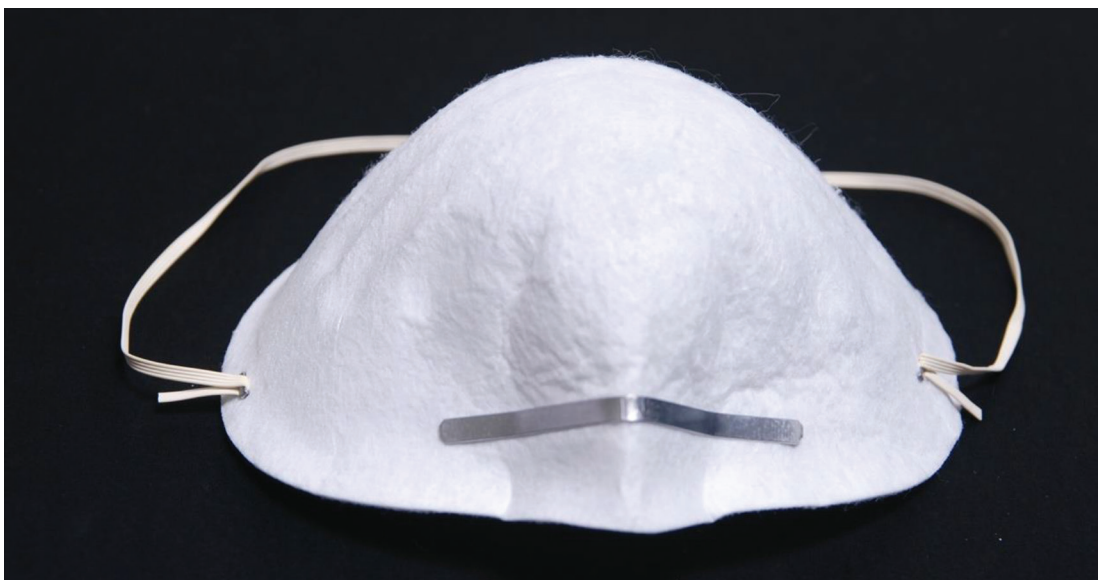
Fig. 1 Filter mask ( http://fotoedukacja.edu.pl , CC BY-SA 3.0).