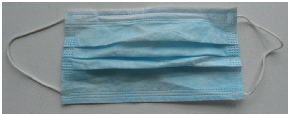
Fig. 2 Common dental office surgical mask (CC0).